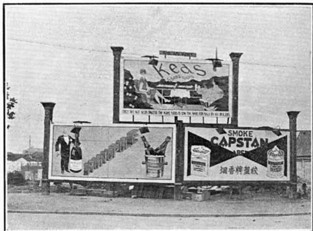
Of the three means of recreation here placed for public choice, only the one on top seems proper.