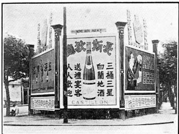
China to be "wet"?—light beers on the two sideboards out-shine "Castillon" in the centre 2-1.