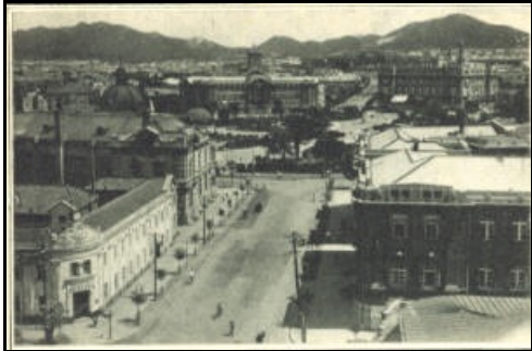
CITY OF DAIREN

easily hold their ground with dignity and without apology, among the structures of up-town New York. No paying business, however, is this institute of eleemosynary work. That it would bring no direct or indirect returns was a foregone conclusion. And yet the 8,000,000 yen Hospital was constructed and is maintained by the S. M. Railway Company at no small yearly cost. The expenses for running 21 similar hospitals scattered along the railway lines and those for the upkeep of various schools are a heavy drain upon the earnings of the same Railway. The Japanese Government, however, takes the responsibility upon itself to function as a civilizing force and, through the S. M. R. Co., sees that the community life in general