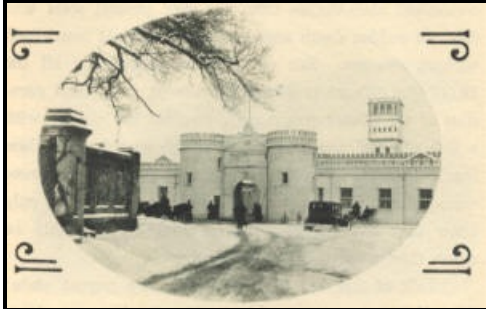
METROPOLITAN POLICE HEADQUARTERS, HSINKING

for the worthless paper Feng-piao. The Chang regime squeezed them with such savagery --- appalling even in China --- that it has thoroughly convinced the Chinese farmers here that nothing under the wide heavens could possibly be worse than the oppression and highway robbery under which they groaned helpless in despair. Mind, this terrific squeeze had gone on year after year. To the farmers, therefore, any change whatever --- was better than the actual state of things. In their eyes any change was a change for the better.