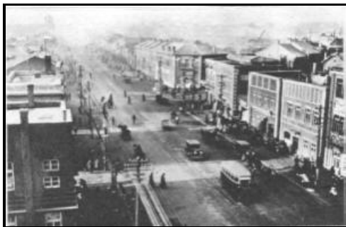
RAILWAY ZONE, HSINKING

This is no time to start new construction in North Manchuria,