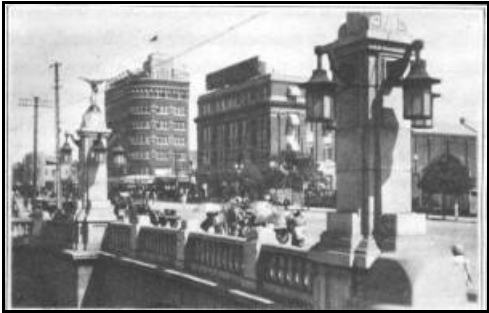
A STREET SCENE IN DAIREN

covers more than 1,833,000 square meters and it boasts of a monument which is the Japanese equivalent of the grave of the " UNKNOWN SOLDIER " at Arlington. It has all civilized conveniences including a couple of baseball grounds. And in all this I have merely covered the A. B. C. of the " sights " of the place.