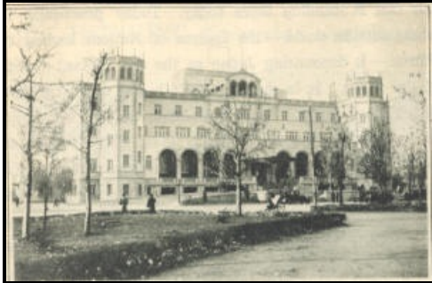
YAMATO HOTEL, MUKDEN

dead --- dead as the old ex-bandit Chang Tso-lin's dream of a new dynasty on the dragon throne at Peking. Not a single wheel was turning in that vast enclosure. Not a hum or a whirl in all that bewildering world crammed full with the most modern and approved machinery for the manufacture of war materials. It went dead the instant it fell into the hands of the Japanese army.