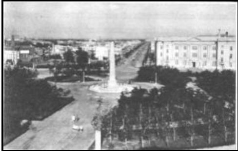
CENTRAL CIRCLE, MUKDEN

city into six squares. The Old Town has long since outgrown the wall and spread out in all directions. A mud wall encircles the overflow spreading over nine square miles of area.