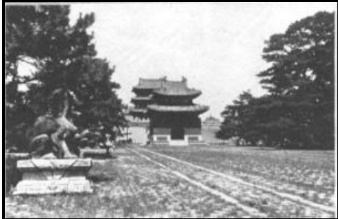
NORTH MAUSOLEUM, MUKDEN

Once more on the rear platform of the through express of the South Manchuria Railway, out of Mukden and bound for Changchun. The deep russet wave of ripening kaoliang stretched away to the far clouds on the horizon, broken only by a cluster of thatched mud huts here and there. The picture of fruitful peace covered every nook of cultivable land. Not a hint or scar anywhere of the bandit raids or the horrifying turmoil so vivid on the front pages of great New York newspapers. Only on the station platforms one catches the glimpses of crescent piles of sand