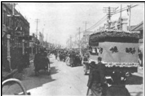
PARADE IN THE NEW CAPITAL IN CELEBRATION OF THE FOUNDING OF MANCHUKUO

and son, squeezed the peasants through taxation and more especially by forcing them to sell their entire crops