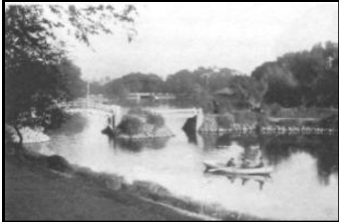
WEST PARK, HSINKING