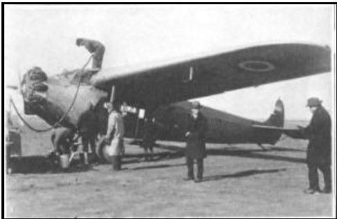
AIR PORT, HSINKING

native populace who have known nothing of government other than exaction, extortion, oppression.