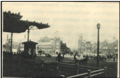
RAILWAY STATION PLAZA, MUKDEN

happening? But that is a regular thing with the primitive life out yonder. The peasants of South Manchuria are not so badly off after all: there are lots of people in a darker valley right in the heart of that mother land of prosperity called the United States.