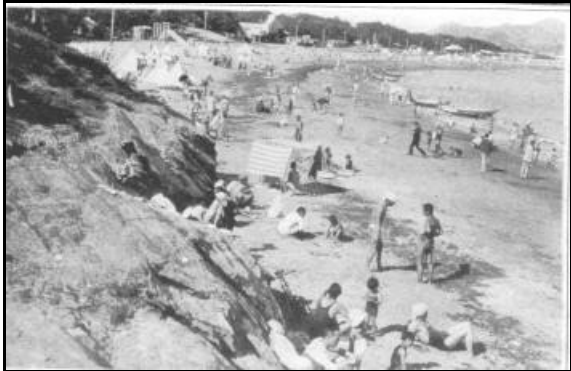
HOSHIGAUURA --"THE PORT OF THE STARS"