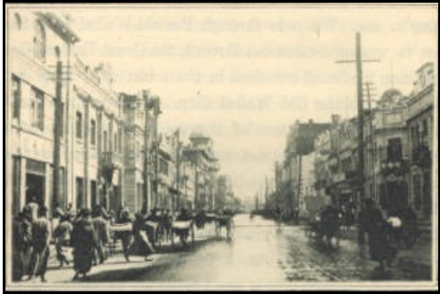
WALLED CITY, MUKDEN