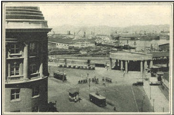
THE WHARF AT DAIREN