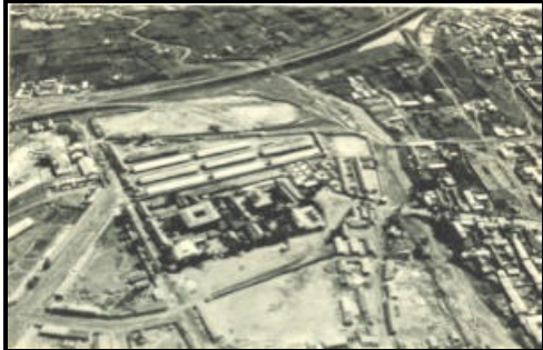
AERIAL VIEW OF THE GOVERNMENT BUILDINGS, HSINKING

streets of the city and out into the surrounding country. The great Central Park was full of picknicking folks. In its athletic fields, a lively game of baseball between two rival school teams of the town was in progress. And on the faces of people there, there was not the slightest sign of depression so pronounced on the features of almost every other city the world round in these trying times. They were gay in dress and voice : they seemed to have plenty of money to spend.