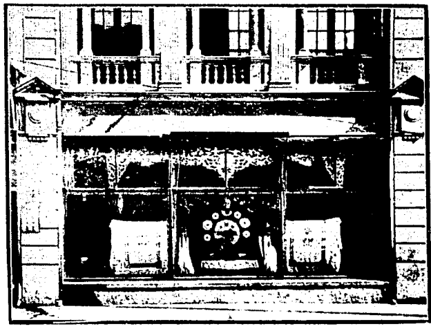
Southeast Window-Showing Linens

distinctiveness of the shop has attracted even the older residents of China and the quality of the products is holding the trade.