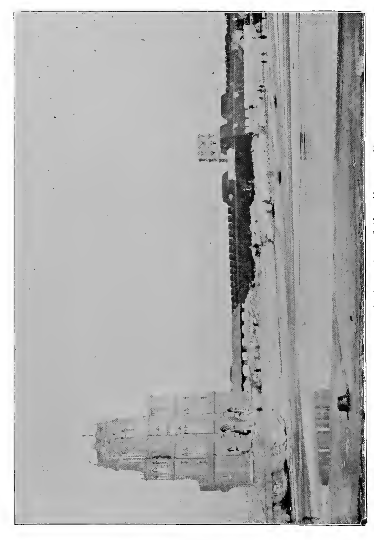
THE SHUT-SHIII YING, and the ruins of the FRENCH CATUEDRAL.