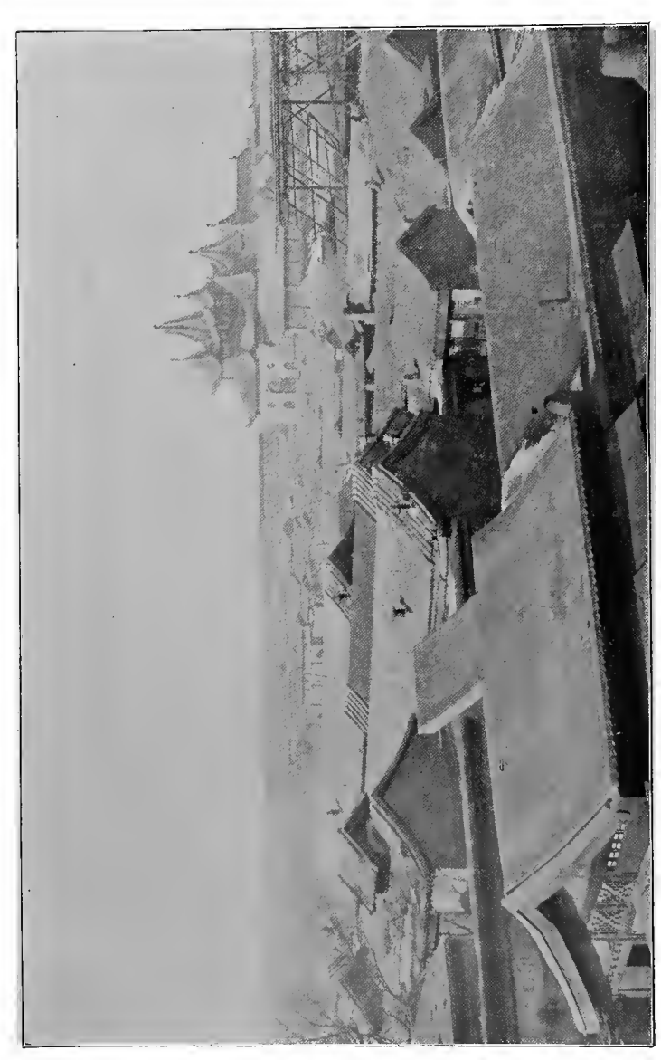
View of Tientsin to the north of the north-west corner of City Wall, mahometan mosque on the right.