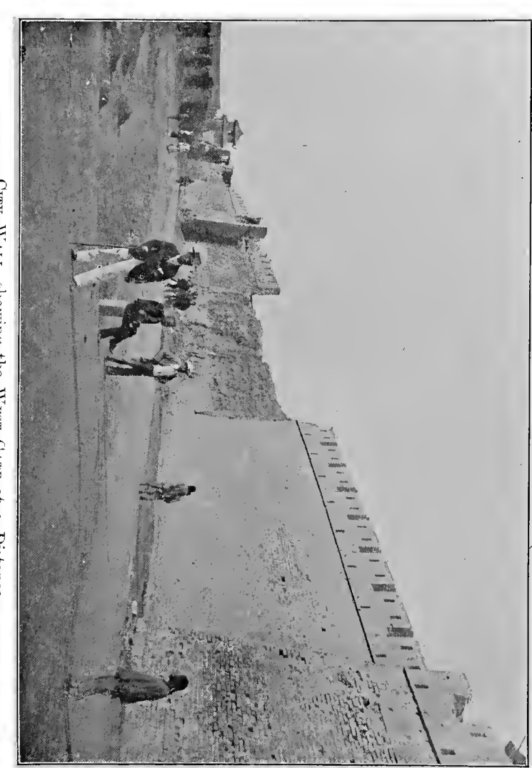
CITY WALL, showing the WEST GATE at a Distance.