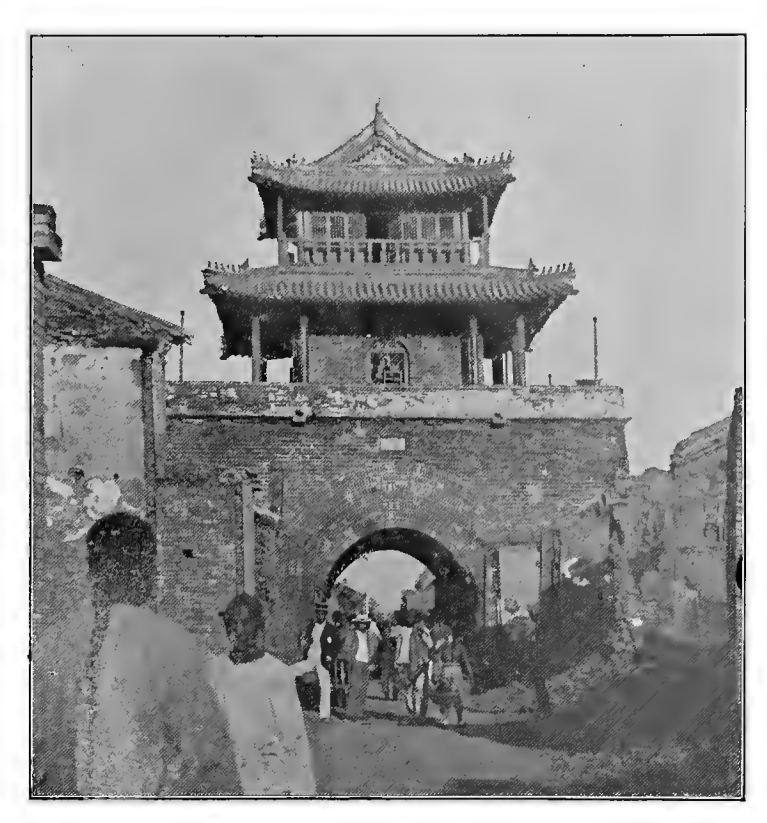
Ku-Lou, or Drum Tower.