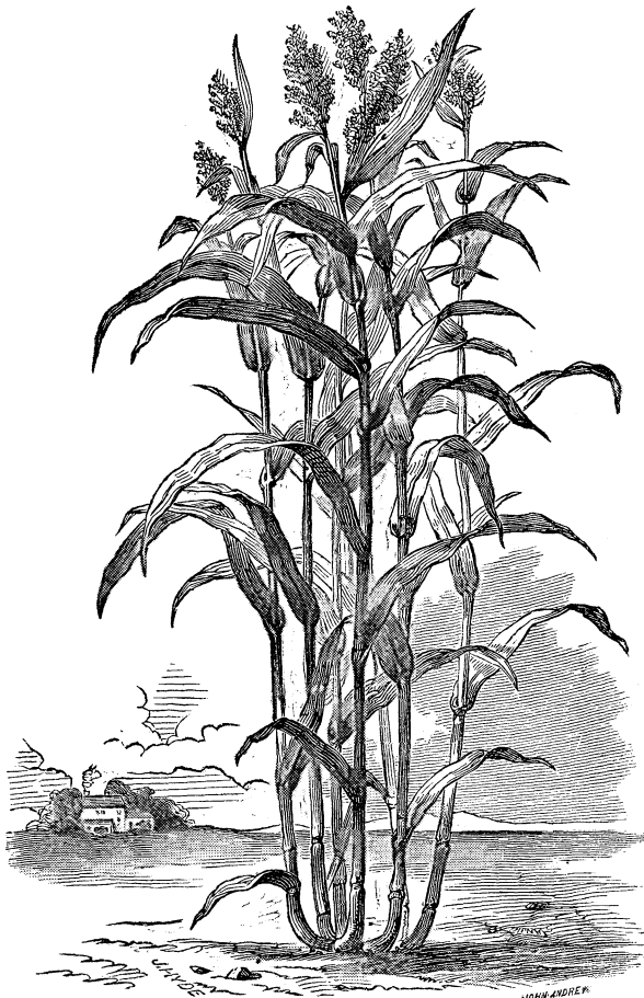
THE CHINESE SUGAR-CANE.