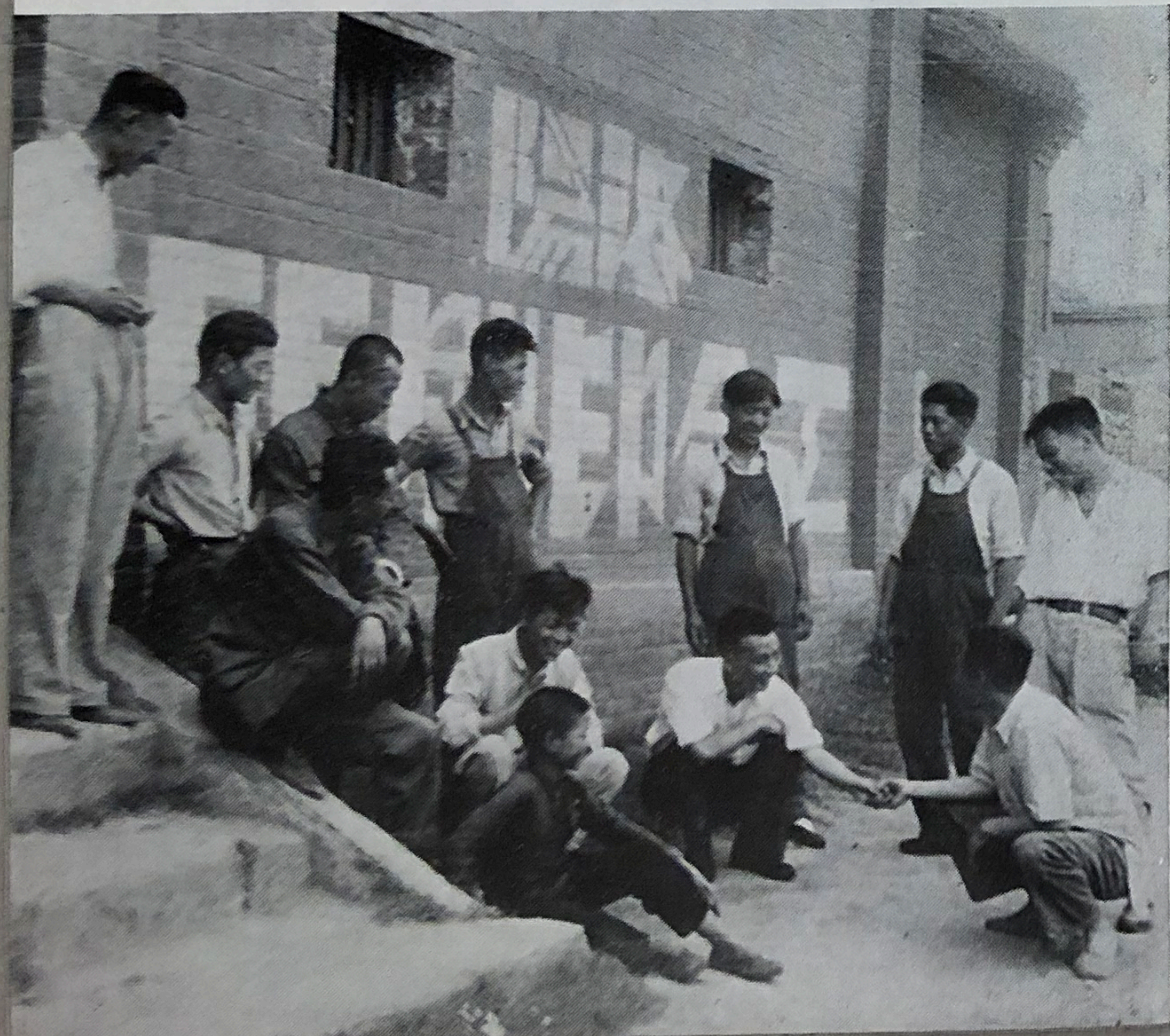
Rest Hour in a C.I.C. Machine Shop

mon Good Fund" to establish schools, clinics, hospitals and training courses for C.I.C. members and their families. Other funds are set aside to repay the loan or to enlarge the workshop.